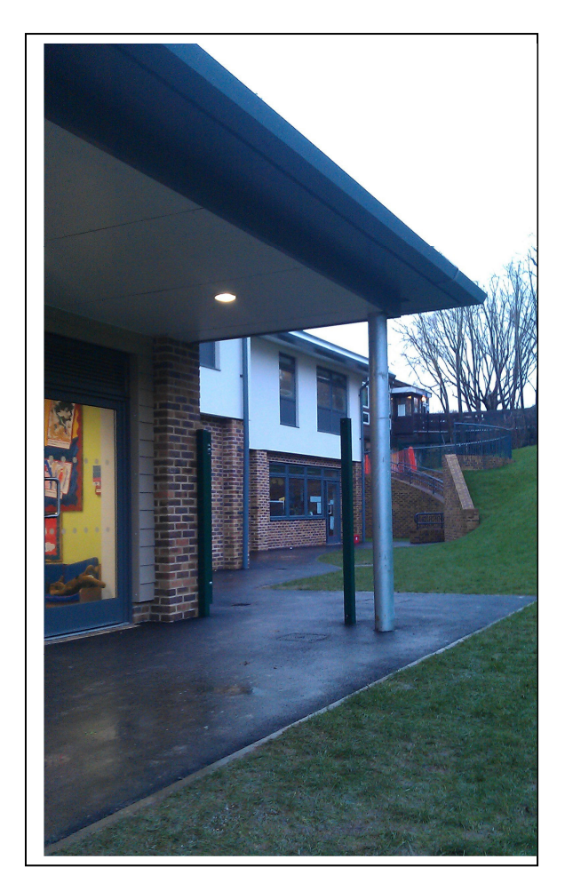
Westdene Extension completed 2012